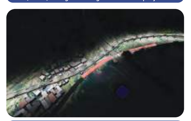
Night view of proposed ROB at LC 465 near Miraj Railway Station in Sangli district