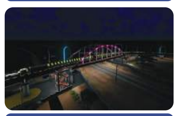
Bow String ROB at LC 548 between Rewral and Tharsa Station on Nagpur - Durg section of SECR