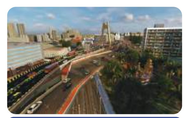
3D representation of proposed Cable Stayed Road Over Bridge near Byculla Railway Station in Mumbai