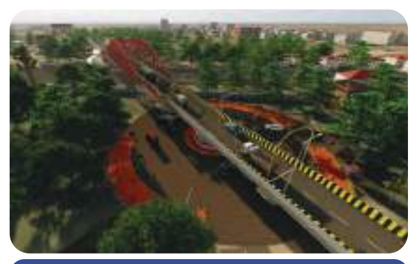
ROB at LC 122 connecting Parbahni city with Agricultural University near Parbhani Jn. Railway station of SCR