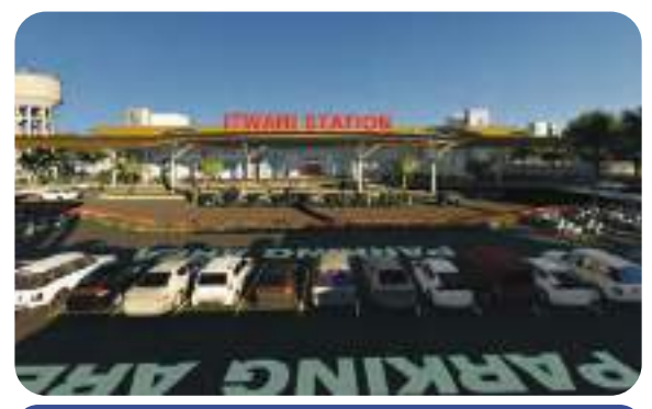
Proposed Multi modal Itwari Railway Station of Nagpur (Itwari) - Nagbhid Gauge Conversion project