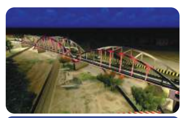
Road Over Bridge (ROB) at LC 144B near Hingoli - Deccan Railway Station in Hingoli district